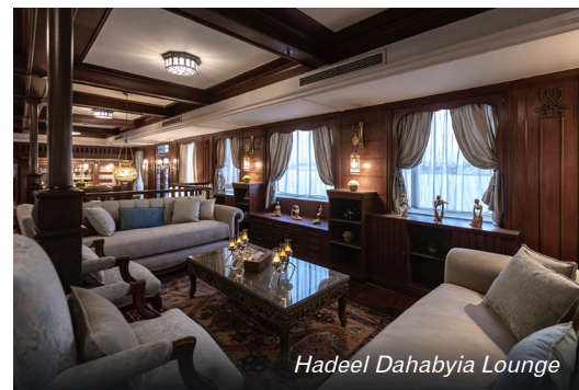
Hadeel Dahabyia Lounge

of sphinxes, which cover a vast area – the result of continuous building for over a thousand years. Then continue to the Temple of Luxor, which developed over many centuries, built overlooking the Nile and is dedicated to the god Amun. Dinner on board.