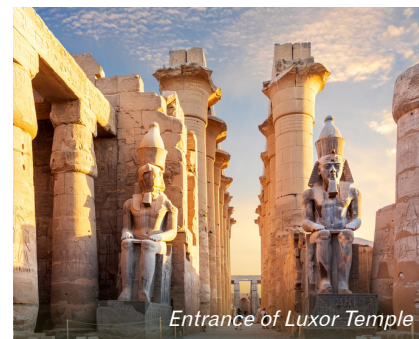
Entrance of Luxor Temple

the Dead where the pharaohs-built tombs, many of which still retain their exquisite painted or carved relief decoration. Visit some of the most important of these before continuing to the superbly restored Queen Hatshepsut's Mortuary Temple, which rises out of the desert plain in a series of terraces. Also see the Colossi of Memnon, two gigantic and much damaged statues, which have stared out across the desert for thousands of years. Transfer to board your Nile cruise vessel, the Hadeel Dahabyia, home for the next five nights. This vintage Nile Dahabyia boat, offers a combination of traditional style and modern luxury. There are eight comfortable en-suite cabins as well as a restaurant, a lounge bar, spacious sun deck and jacuzzi.