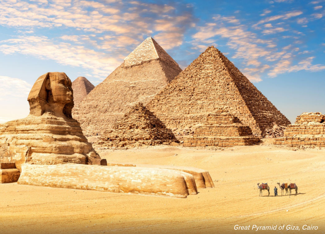
Great Pyramid of Giza, Cairo