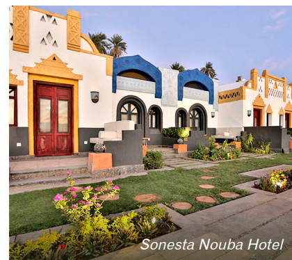
Sonesta Nouba Hotel

Lunch under own arrangements. Return to Abu Simbel airport for an Egypt Air flight to Aswan and transfer to the hotel. Dinner under own arrangements.