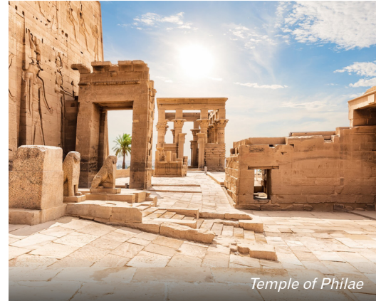
Temple of Philae