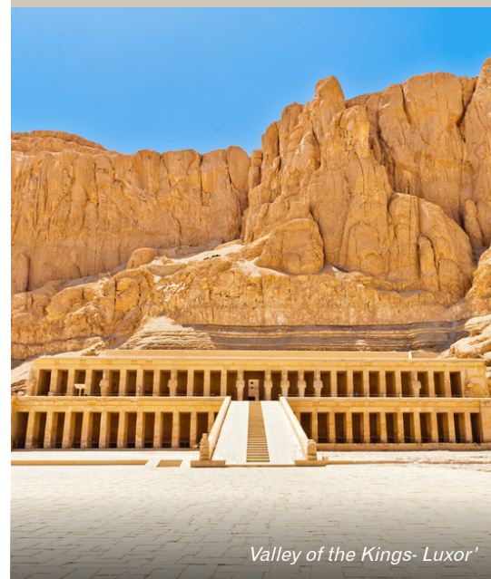
Valley of the Kings- Luxor'