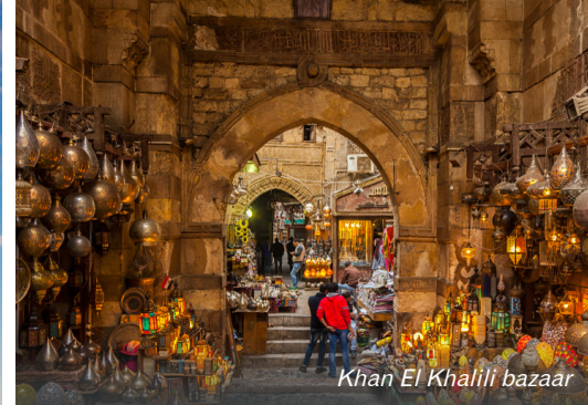
Khan El Khalili bazaar