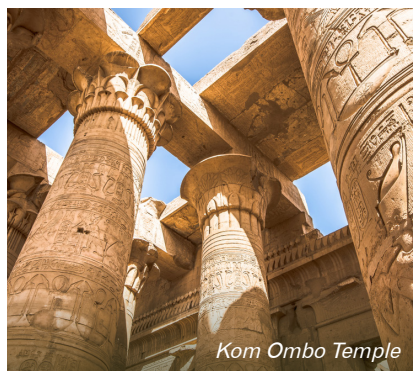
Kom Ombo Temple

Lunch on board. Afternoon at leisure. Remain at Kom Ombo overnight. Dinner on board.