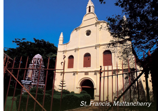
St. Francis, Mattancherry