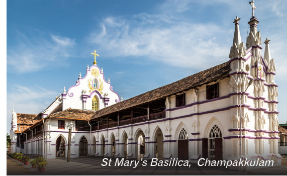
St Mary's Basilica, Champakkulam