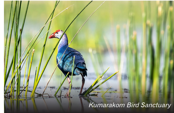
Kumarakom Bird Sanctuary