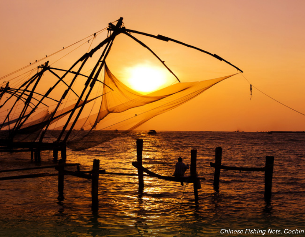
Chinese Fishing Nets, Cochin